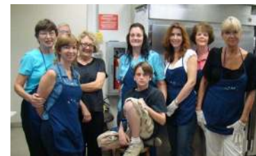
First Friday Team, Good Shepherd Center

College Park Elementary: Tutoring, Uniform collection, Back-to-school Lunch Empty Bowls Pathways to Growth Good Shepherd Center Mother Hubbard's Cupboard Interfaith Refugee Ministry Wilmington Interfaith Hospitality Network